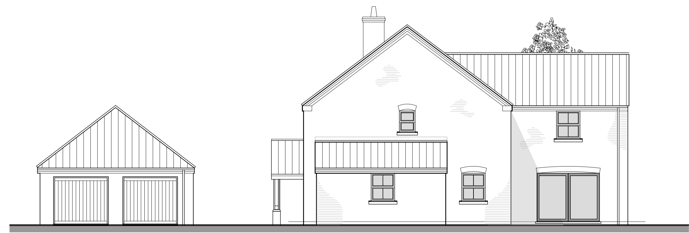
Proposed Side Elevation (1:100)