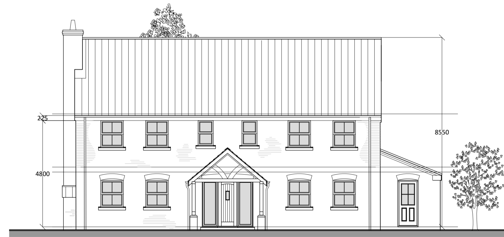
Proposed Front Elevation (1:100)