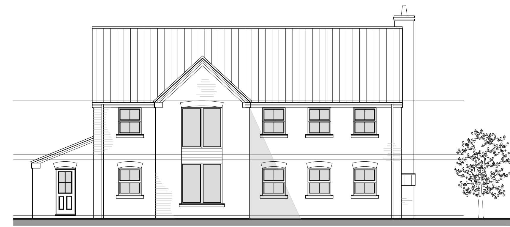
Proposed Rear Elevation (1:100)